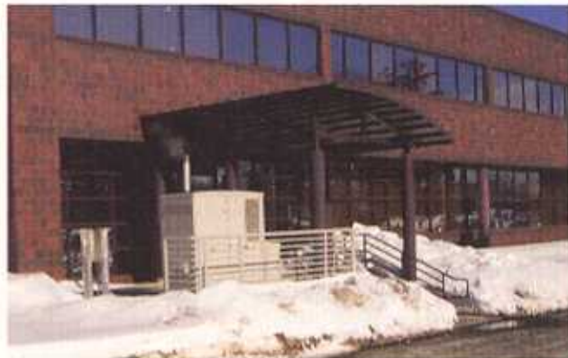
A fuel cell (above) outside Plug Power's headquarters. At left is a section of the finite-element model of the stack, rendered in Ansys software.

This article was prepared by staff writers in collaboration with outside contributors.